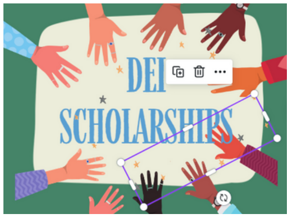
What does DEI mean to SHAA?

Since the SHAA DEI Committee was established, the following has occurred: 1) a committee was established that meets at each convention to discuss DEI issues and ways to increase awareness, 2) two graduate minority student scholarships based on race and ethnicity, as well as males were developed (AUD and SLP) at $500 each, and 3) a DEI sub-track of the professional track of the annual convention was established to ensure DEI presentations were included each year. Although the committee has achieved a lot in 3 years, there are several other visions that can be implemented including a minority mentorship program and undergraduate minority SLP and AUD student scholarships.