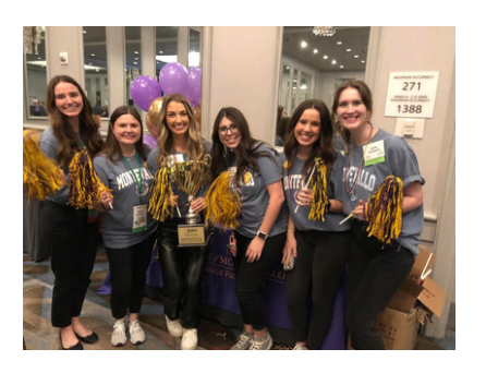
University of Montevallo team: 2023 champs!

We can't wait to celebrate and cheer on these future professionals!