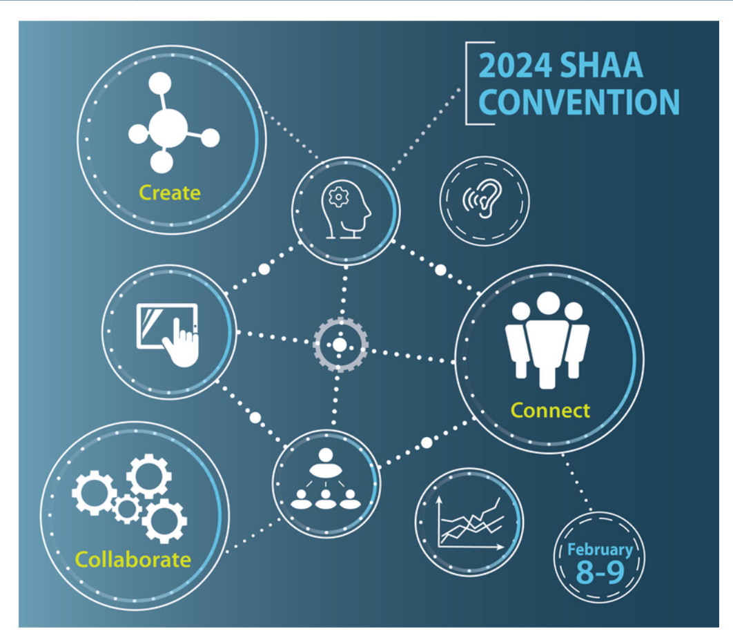
SHAA Convention 2024: Create, Connect, Collaborate!